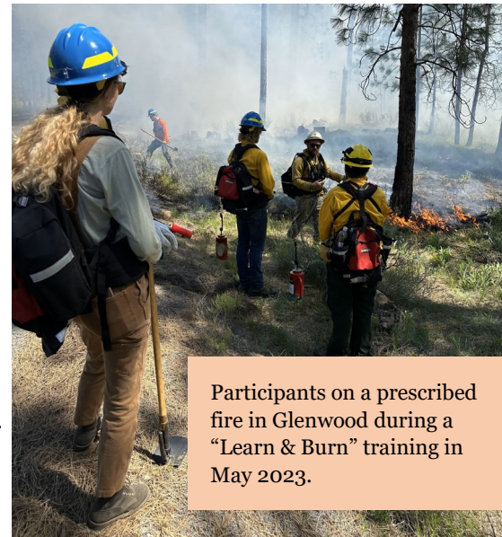
Participants on a prescribed fire in Glenwood during a “Learn & Burn” training in May 2023.

Whether you’re looking to use prescribed fire on your property or are simply interested in helping advance prescribed fire efforts in this region, you’re invited to join the first MAPBA community meeting on December 11, 2023 at 6 pm at the White Salmon Fire Department. Come to learn about the MAPBA, ask questions, and provide feedback about how the MAPBA could best help you.