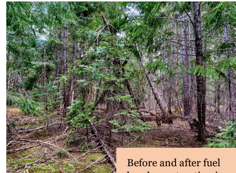
Before and after fuel break construction in Trout Lake this spring.

With an influx of federal funding to several organizations in Klickitat County for fuel break implementation (more information to come!), you’ll likely be noticing many more of these projects in the region. FACT will be hosting a Q&A tour in July of a fuel break that was constructed in Trout Lake last month. Stay tuned for details!